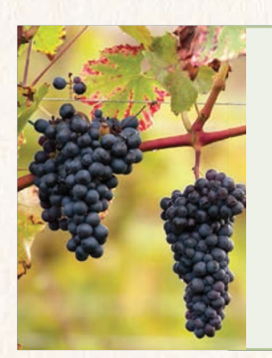
Wine varieties include CHARDONNAY PINOT GRIS GEWÜRZTRAMINER MERLOT CHAMBOURCIN CABERNET SAUVIGNON PETIT VERDOT PETIT MANSENG

and Touriga Nacional. The vineyard, totaling 45 acres, stands alongside the estate at approximately 800 feet in elevation. The elegant wine tasting room also serves to showcase White Hall's production process.