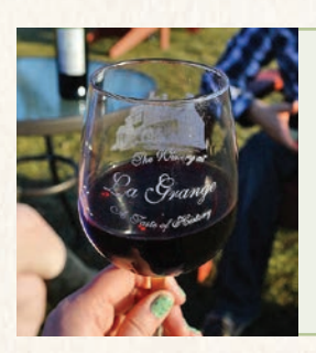
Grape varieties include CABERNET SAUVIGNON PETIT MANSENG PETIT VERDOT

The Winery at La Grange was sold in 2012. The new owners and new employees continue to serve fine wine in an elegant atmosphere.