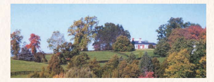
Sherwood Farm: Located just 14 miles from Charlottesville, Sherwood Farm consists of 674 beautiful acres of both pasture and wooded lands in the pastoral Carters Bridge area of fine estates.

White Hart Country Estate: Hidden amidst 353 acres of rolling Virginia countryside in northern Albemarle, this English country manor rests beneath the shadow of ancient majestic oaks. The 8500 square foot residence is constructed with superb quality materials and craftsmanship.