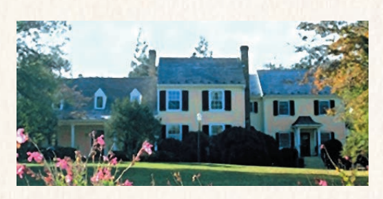
Windholme Farm: A 235 acre equestrian estate featuring an exquisite 18th century manor home with several charming cottages and superb horse facilities. Set amidst beautifully rolling meadows and magnificent hardwood forests.

Seven Oaks: Located in beautiful Greenwood, and a Virginia Historic Landmark "of statewide and national significance." Situated on a prominent knoll in Albemarle County with commanding views of the Blue Ridge Mountains.