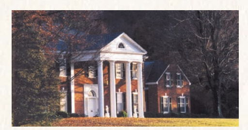
Verulam: A brick, 8,600 square foot mansion built in 1941, Verulam offers nearly a square mile of beautiful gardens, huge oak trees, and 550 acres with the perfect balance of open meadow and hardwood forests.