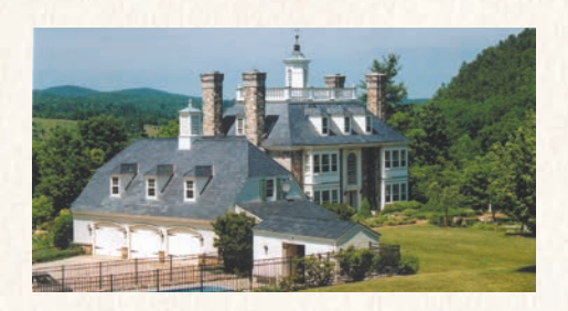
Stone Ridge: A grand Georgian Colonial manor house offering 8,900 square feet of living area on 1,250 acres on the shores of the James River. This home site has broad views of the Blue Ridge Mountains and the James River Valley.