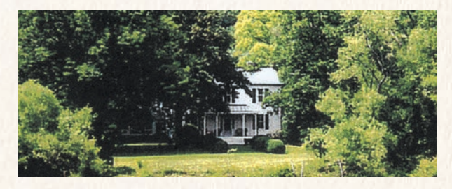
Mountain Hollow: Situated in the beautiful Greenwood estate area of Albemarle County. The turn of the century home is situated under a canopy of large trees, shady lawns and beautiful gardens.

Red Horse Farm: A classic Virginia farming estate built in 1800, overlooking 513 rolling acres with fantastic views of the Blue Ridge and Southwest Mountains. The two story brick country home reflects the long lost craftsmanship of that bygone era.