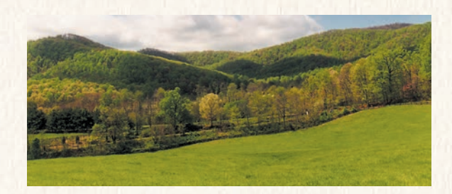
Sutherland: 580 totally private acres at the headwaters of the Hardware River, 10 miles south of Charlottesville. An entirely private mountain valley with numerous spectacular building sites, pure mountain streams, and wild flower filled meadows.