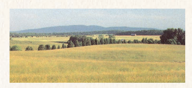
Green Springs Farm: In the heart of the historic Green Springs District of Louisa County, on 995 spectacular acres of farm land. This rare and private Piedmont farm of rolling terrain and fertile soils is complemented by exceptional water resources including two lakes.