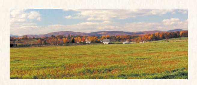
Kluge's Lone Oak: Features 1390 acres of rolling, open and wooded highly productive farmland, bisected by beautiful Ballenger Creek and graced by broad Blue Ridge Mountain vistas.