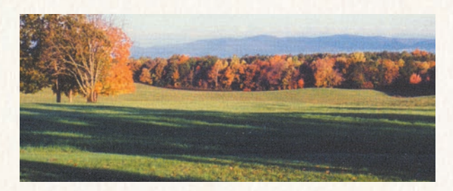
Foxport: Situated at the base of the Southwest mountains with panoramic views of the Blue Ridge Mountains. The 4,100 square foot home is located on 353 secluded and picturesque acres in Albemarle County.