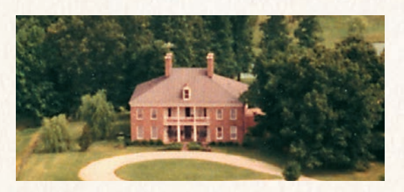
Windermere: A grand brick home built in 1981 in the tradition of the Deep South. Situated on 290 acres of primarily rolling fields and meadows, fenced for horses and other livestock. Within ten minutes of Charlottesville.