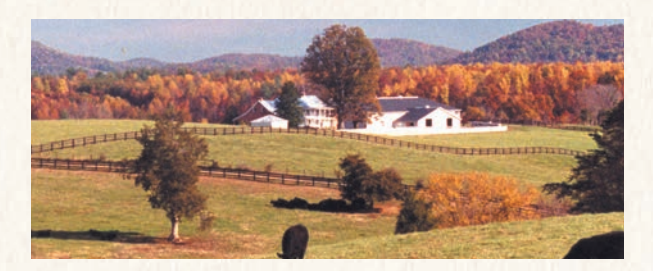
Monte Vista Farm: An exceptionally beautiful, classic Virginia farming estate situated on 761 picturesque acres surrounded by a 360 degree mountain panorama. Combines gently rolling hills, meadows, forests, streams, ponds and lakes.