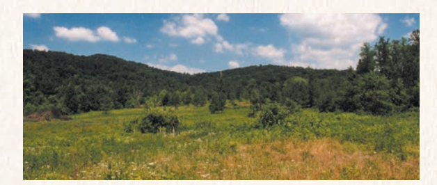
Green Mountain Valley: 579 totally private recreational acres in Northwest Albemarle County. Fresh mountain streams originate in the surrounding mountains and flow through the meadows and forests below. A naturalist's wild life paradise.