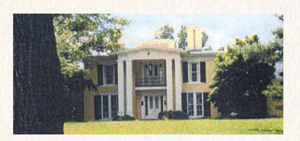
Edgewood: A fine old Virginia house sited on 453 acres overlooking the Blue Ridge Mountains and the scenic Rapidan River. Built in 1853, the house is a fine example of Greek Revival architecture set in a group of towering hardwoods.