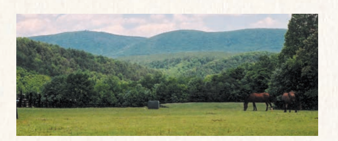
Hickory Hill: An extraordinary 258 acre estate situated on the eastern banks of the James River. This very private property offers panoramic views of the Blue Ridge Mountains and lush open pastures for horses and cattle.