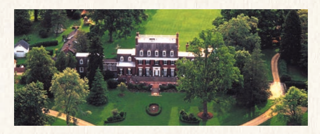
Blue Ridge Farm: A magnificent 12,000 square foot manor home on 124 park-like acres with extraordinary mountain vistas. Charming guest houses, pool, stables, two large ponds and classic landscaping in an area of historic estates.