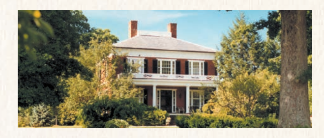
Esmont: One of Virginia's most classic Georgian homes set on a high knoll in the Green Mountain section of Albemarle County. The estate has substantial facilities for horses, and would be well suited for other livestock as well.