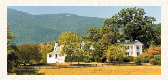
Woodley Farm: Situated on 200 beautiful acres of open, rolling fields which surround the main houses and stables. This site of two manor homes was obviously chosen for the spectacular views as well as for the shade of the huge oak trees.