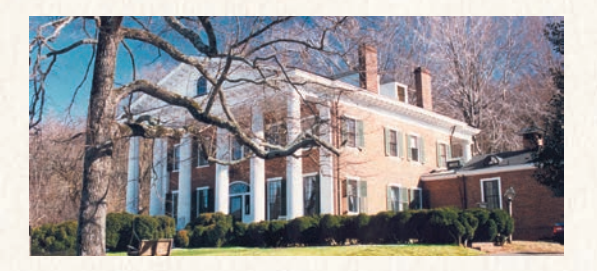
Rocklands: An 18th century home situated on 2,000 acres of gently rolling hills. Rich in Virginia history, this home is now registered as a Historic Landmark by both the Commonwealth of Virginia and the U.S. Department of the Interior.