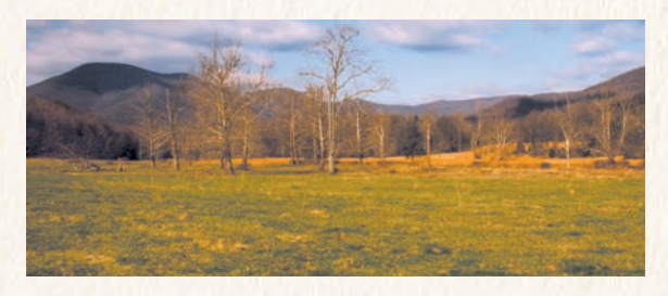
Rockfish River Farm: A spectacular river front farming estate of 490 acres, bordering the Rockfish River and Spruce Creek. A pleasant mix of open and wooded land rising from rich bottomland to mountain peaks.